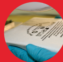
Tagless textile printing with an EAZY 130

Machine specifications are subject to change without notice.