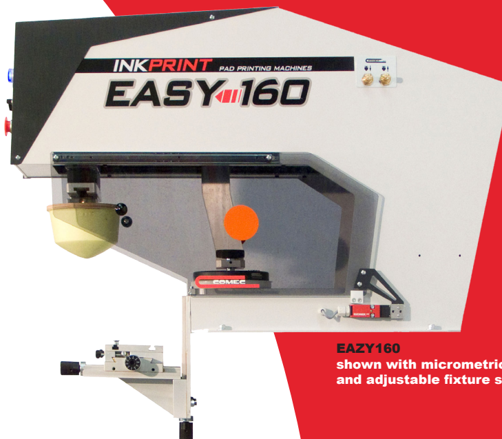
EAZY160 shown with micrometrical and adjustable fixture support.