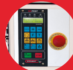
EAZY160 shown with micrometrical and adjustable fixture support.