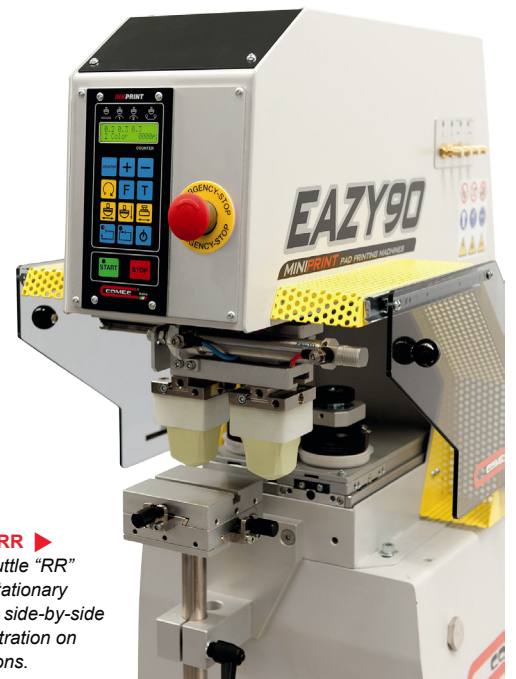
▶ EAZY90 - 2 Color RR shown with pad shuttle "RR" The part remains stationary and the pads move side-by-side for exact print registration on multicolor applications.