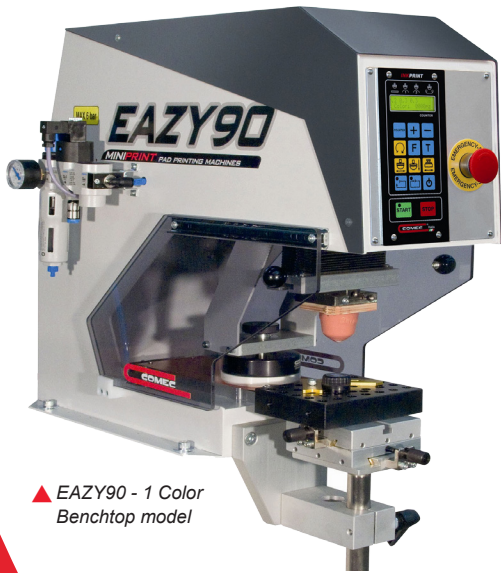
▲ EAZY90 - 1 Color Benchtop model

INKPRINT EAZY 90, 130 and 160 are the ideal economical pad printing solution for textile printing and all general production applications. Available in one and two color configurations.