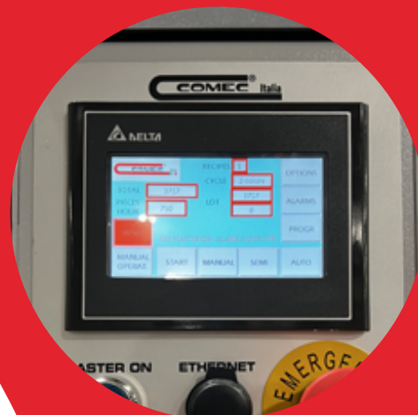
Easy touch pad controls

Scan here to subscribe to our YouTube channel!